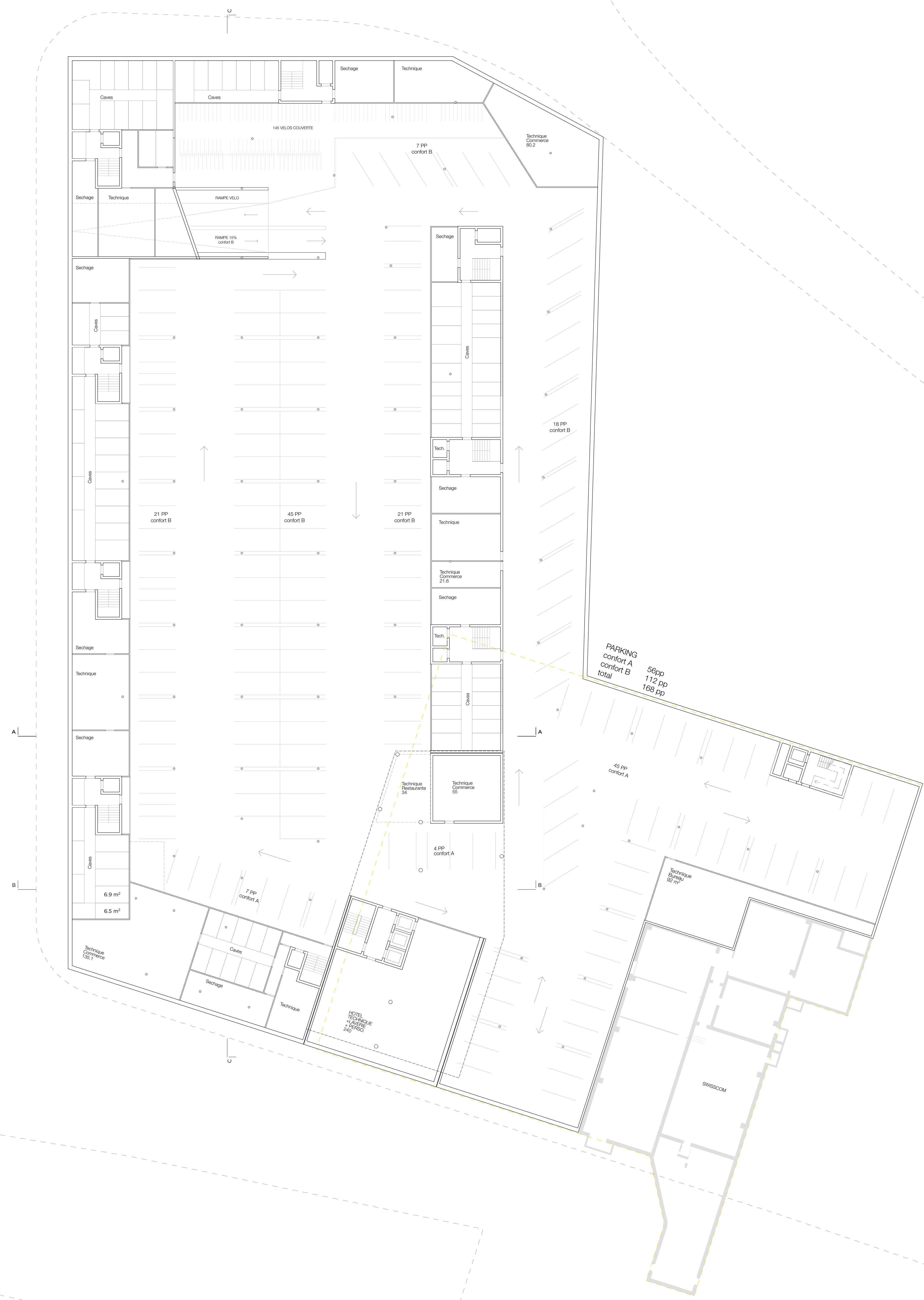
SOUS-SOL / 1:200